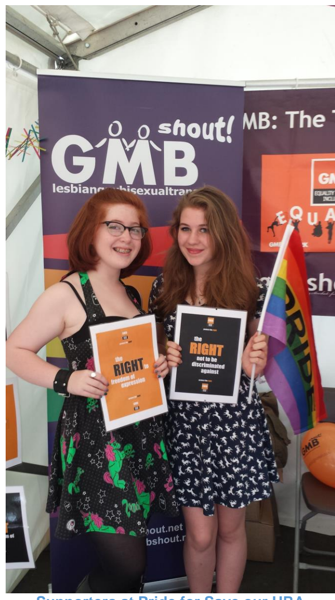
Supporters at Pride for Save our HRA

We're also campaigning to bring Prides back as community-based and run events. In London we